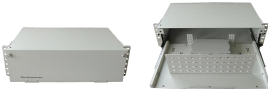
FIBER DISTRIBUTION BOX (Rack Mount) 3 U

The rack mount enclosure is designed for high density patching application. The rack enclosure is available for 12, 24, 48, 72, 96, 120 fibers in the standard beige color. The sliding tray have ball bearing slide hanging which easy to push or pull and also they provide the patching area for patch splice. The splicing tray cab splice 12 fibers/ each tray, easy to add the splice tray.